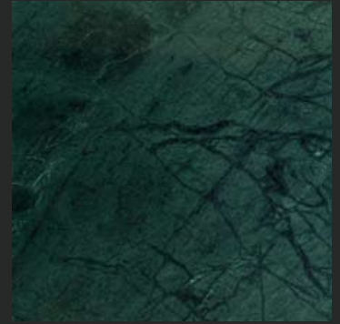
Emerald Green Marble